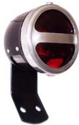
2 – Universalsrücklicht