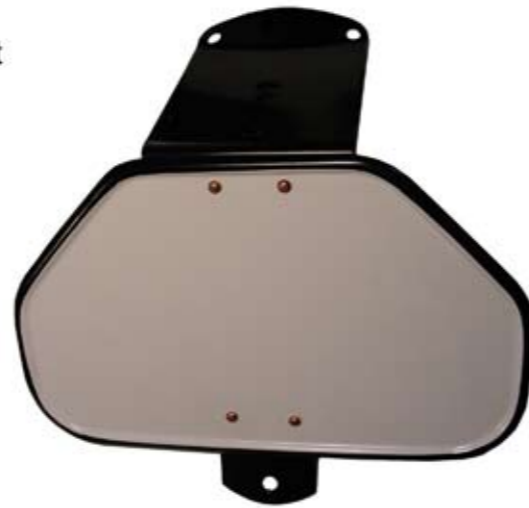
5 – Nummernschildplatte