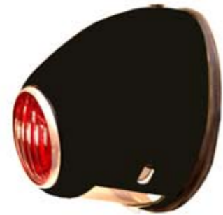
1 – Nasenrücklicht