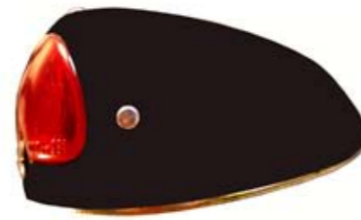
3 – Eierrücklicht